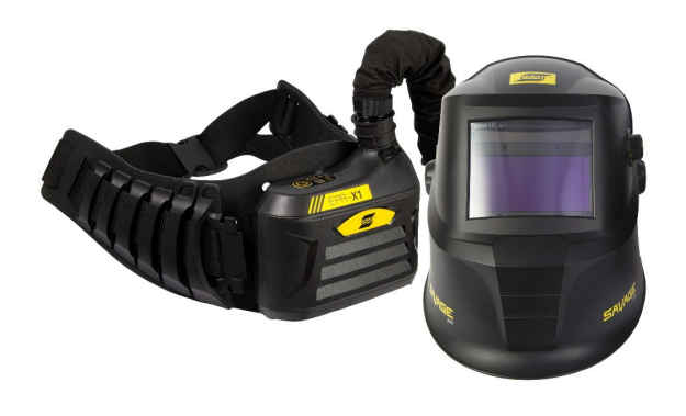
EPR-X1 with Savage A-40 Air Helmet