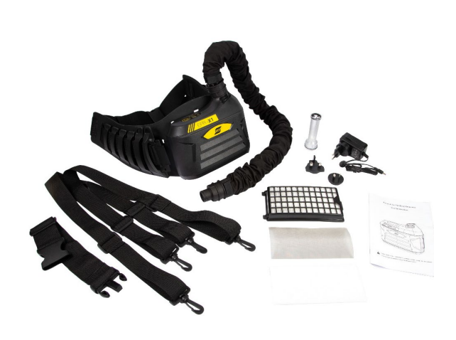
EPR-X1 PAPR System